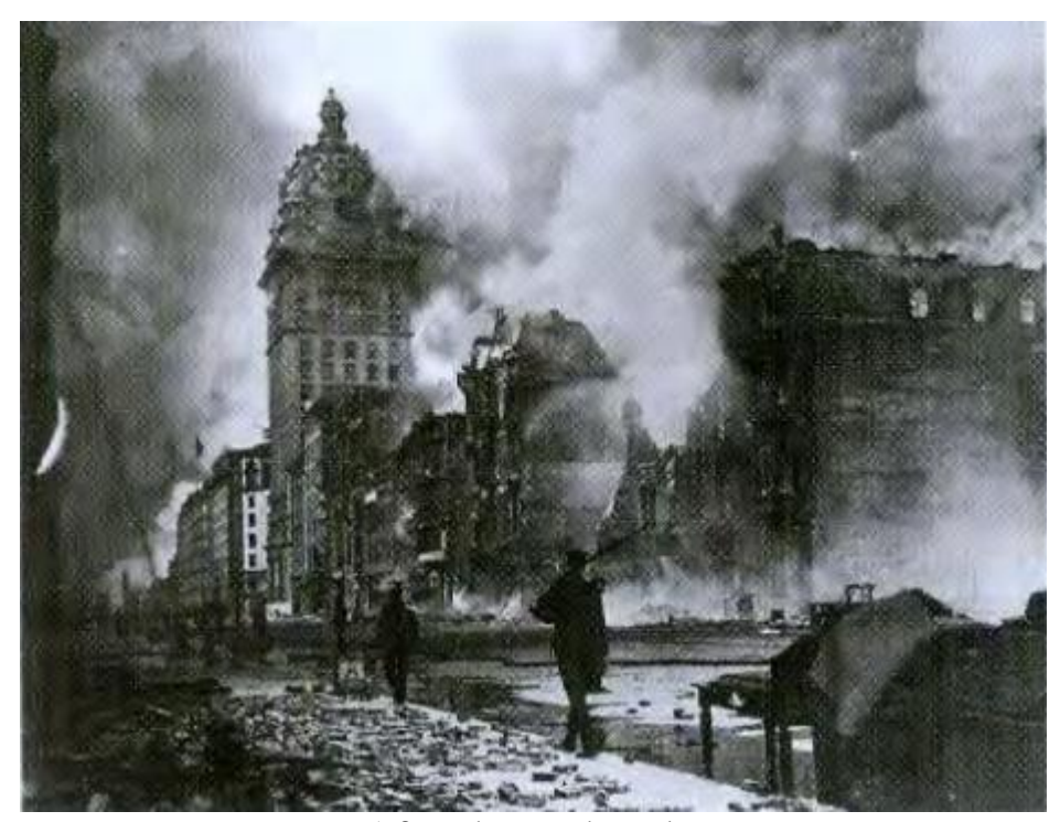
After the earthquake

At 5.13 a.m. on April 18, 1906, there was a terrible earthquake in San Francisco. The earthquake destroyed about 5,000 buildings immediately. Most of the other buildings in the city burned down in the great fire that followed it. 3,000 people died and 300,000 people lost their homes in the fire and the earthquake.