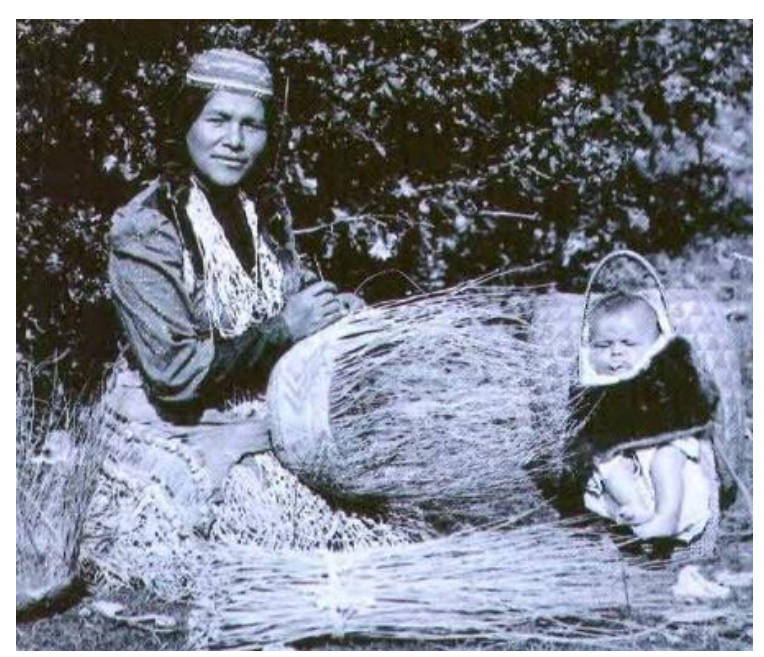
A Karok Indian in 1890

rich. They were often called 'Forty-niners', because most of them arrived in 1849. This was the start of the Gold Rush.