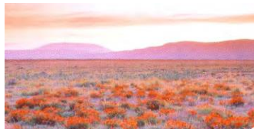
Poppies in Antelope Valley

Two of the most interesting parts of the desert are the Joshua Tree Monument, and Death Valley.