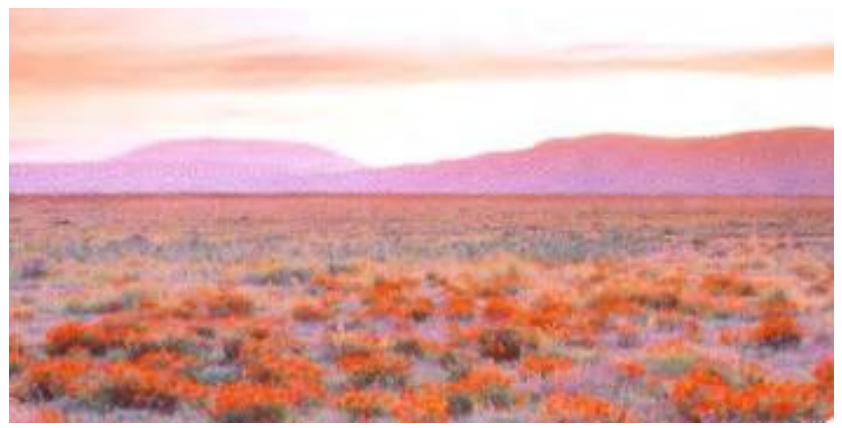
Poppies in Antelope Valley

Two of the most interesting parts of the desert are the Joshua Tree Monument, and Death Valley.