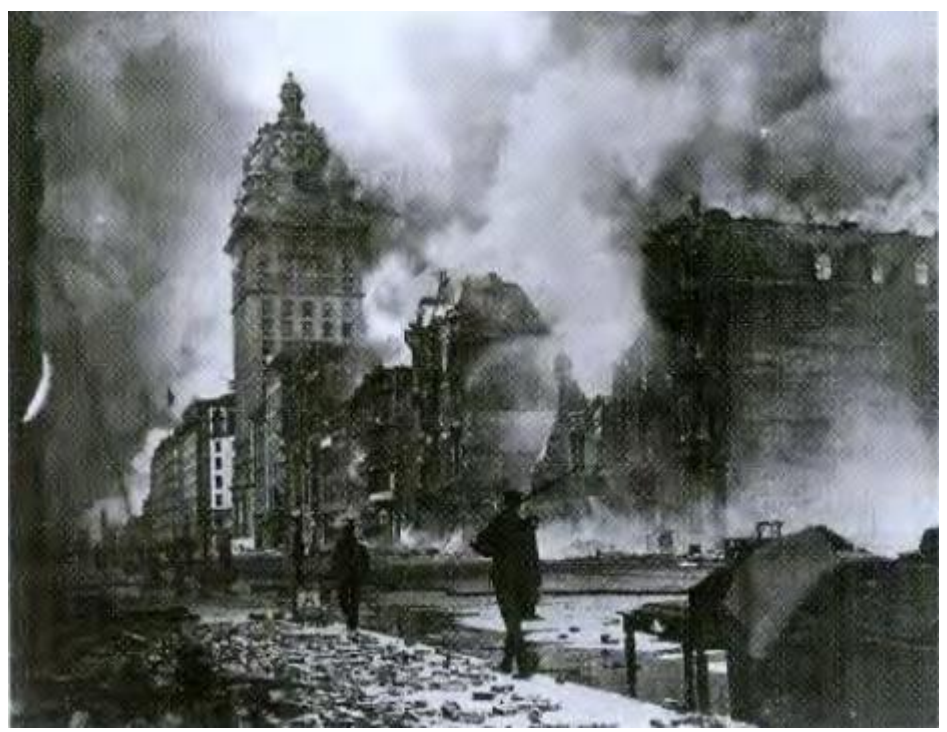
After the earthquake

At 5.13 a.m. on April 18, 1906, there was a terrible earthquake in San Francisco. The earthquake destroyed about 5,000 buildings immediately. Most of the other buildings in the city burned down in the great fire that followed it. 3,000 people died and 300,000 people lost their homes in the fire and the earthquake.