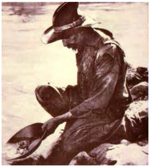
Prospecting for gold

land, eighty kilometres east of Sutter's Fort, which was later to become the city of Sacramento. Suddenly he saw something bright and yellow in a river. Looking more carefully he discovered small pieces of gold, washed down in the river from the Sierra Nevada mountains.