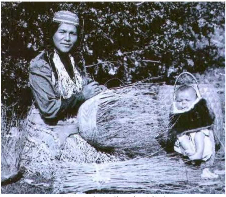
A Karok Indian in 1890

By 1852, there were more than 100,000 prospectors in California. Gold mining villages grew on the lower western sides of the Sierra Nevada mountains - the 'Gold Country'. San Francisco was soon a large, busy city, selling everything the prospectors and miners needed. Sailing ships arrived and their sailors ran off to the Gold Country to look for gold in the rivers, or to work in the mines. Ships often sailed away from San Francisco with half their sailors missing!