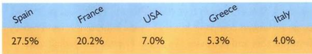
Britons abroad: the most popular holiday places

Europe is still more popular for British holiday-makers than other parts of the world. More people go on holidays to Spain than to any other country. But the USA is popular too. As air travel becomes cheaper, people are starting to go to the Caribbean countries and Australia for their holidays.