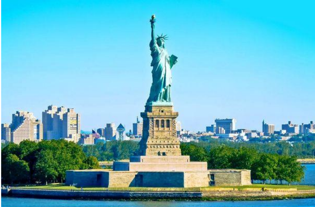
The Statue of Liberty

The statue was the first sight of New York for many immigrants. The look in her eyes was a promise of a new start in a new world.