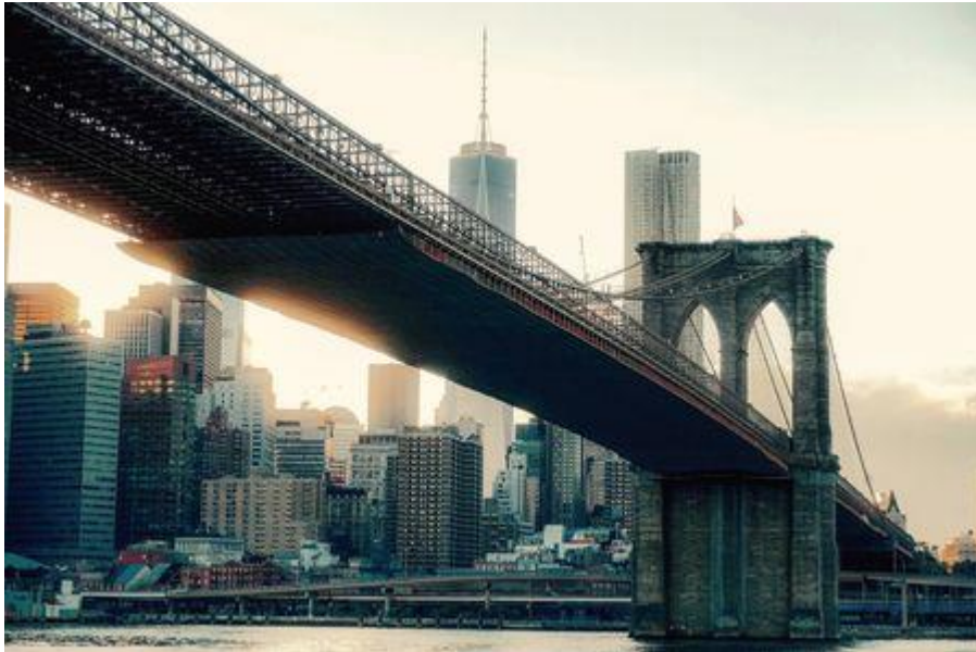
The Brooklyn Bridge

The history of Brooklyn is similar to the story of Manhattan. Farmers first moved to the Brooklyn area in 1636. Like Manhattan, Brooklyn grew and grew. By 1860, 266,000 people lived there. In the next 10 years, 130,000 more people arrived. At that time, the only way between the two cities of Brooklyn and Manhattan was by boat. But in 1866, the New York government decided to build a bridge over the East River. John A. Roebling's plan was the best. He wanted to build a bridge that was "a work of art."