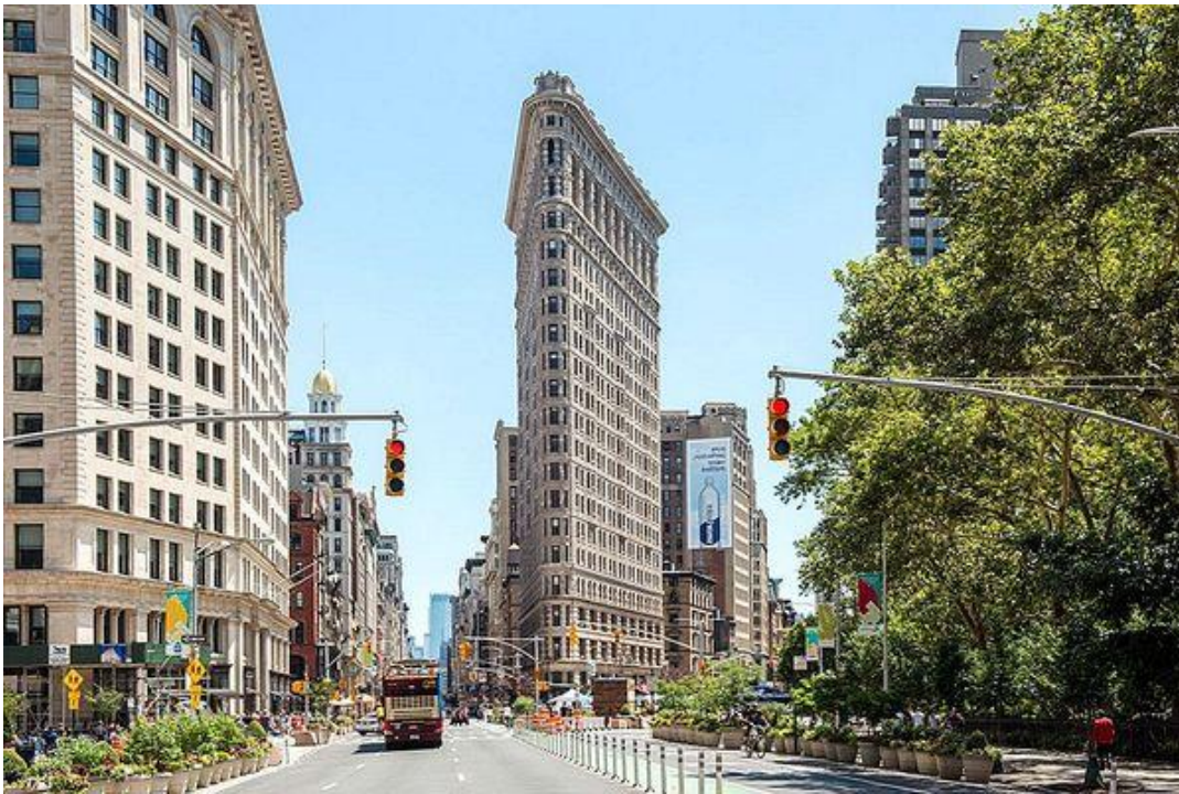
The Flatiron Building