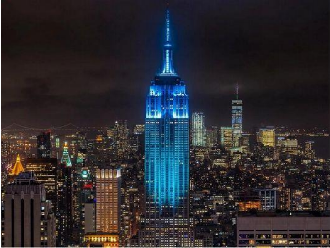
The Empire State Building

The Empire State Building has been in many movies over the years. For example, Tom Hanks and Meg Ryan meet at the top of the building in Sleepless in Seattle . But the building's most famous movie is 1933's King Kong . At the end of the movie King Kong climbs to the top of the building. He fights off airplanes.