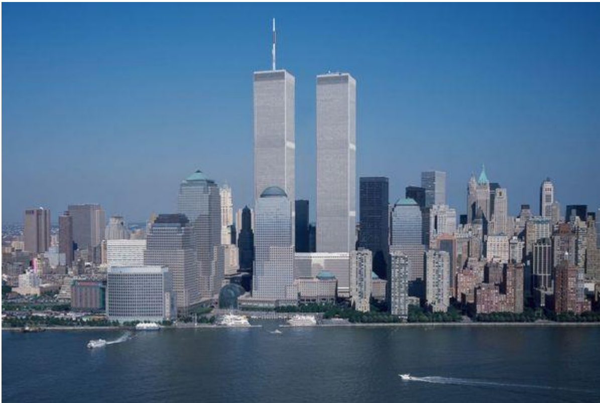
The World Trade Center

From March 11 until April 13, 2002, New Yorkers could look at two towers of light in the sky. They could remember the people who died on September 11.