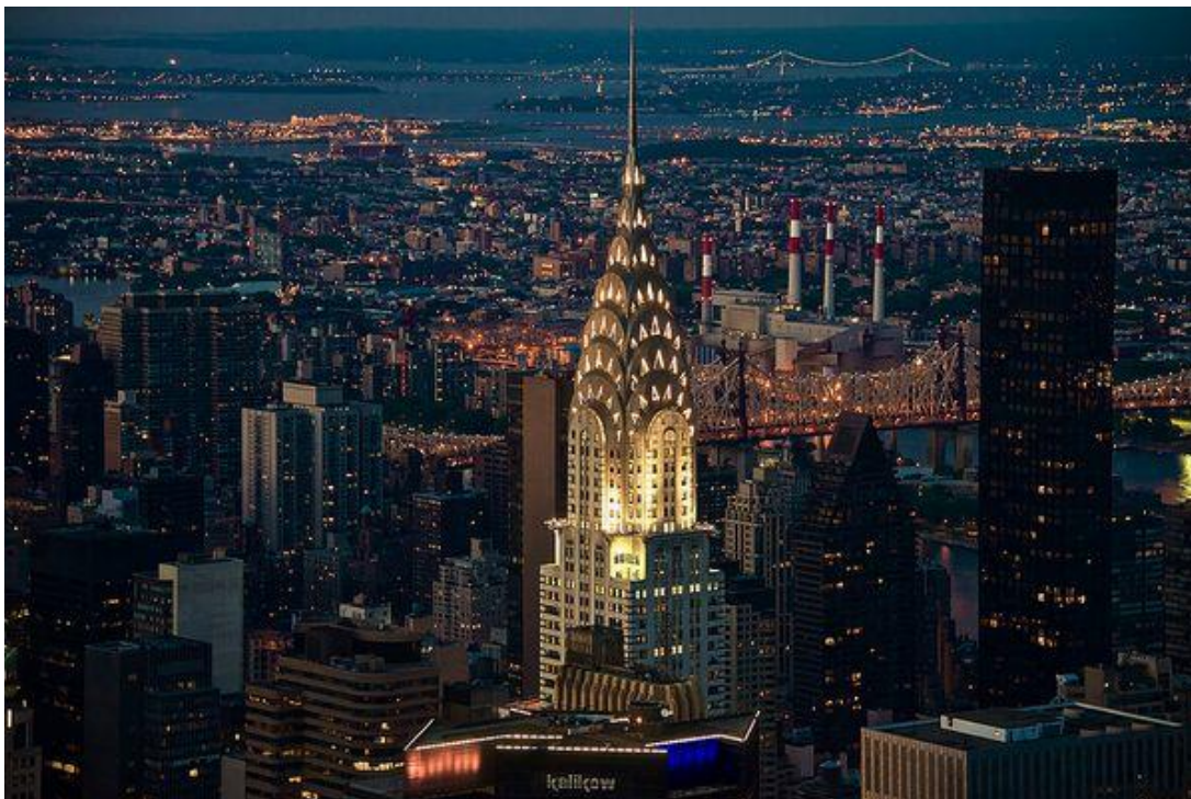
The Chrysler Building

For many people, the Chrysler Building is the most beautiful in the city. It was built between 1928 and 1930 by the car company Chrysler. It was the tallest building in the world ... but only for a year. Then the Empire State Building was finished. The Chrysler Building was built to look like a car wheel. When it was finished, the first floor was a car showroom!