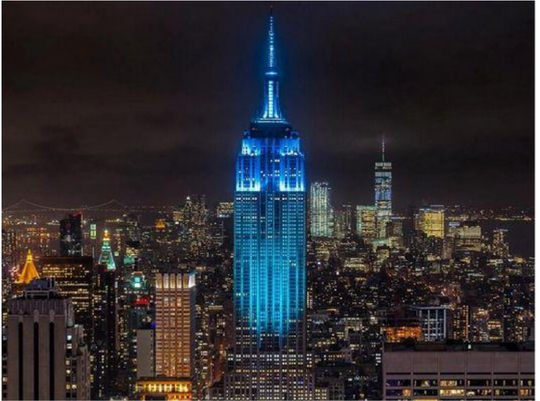
The Empire State Building

The Empire State Building has been in many movies over the years. For example, Tom Hanks and Meg Ryan meet at the top of the building in Sleepless in Seattle . But the building's most famous movie is 1933's King Kong . At the end of the movie King Kong climbs to the top of the building. He fights off airplanes.