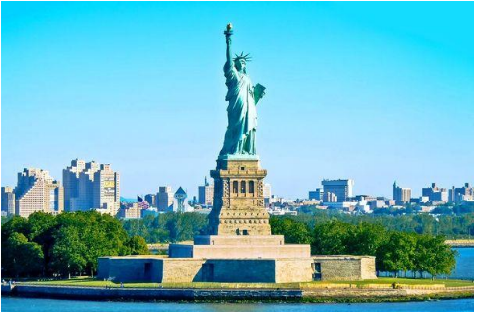
The Statue of Liberty

The statue was the first sight of New York for many immigrants. The look in her eyes was a promise of a new start in a new world.