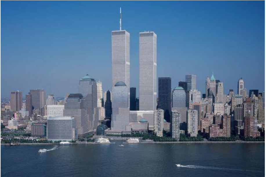
The World Trade Center

From March 11 until April 13, 2002, New Yorkers could look at two towers of light in the sky. They could remember the people who died on September 11.