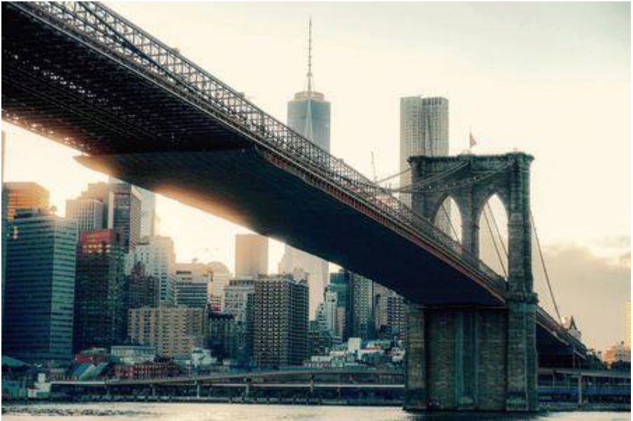
The Brooklyn Bridge

The history of Brooklyn is similar to the story of Manhattan. Farmers first moved to the Brooklyn area in 1636. Like Manhattan, Brooklyn grew and grew. By 1860, 266,000 people lived there. In the next 10 years, 130,000 more people arrived. At that time, the only way between the two cities of Brooklyn and Manhattan was by boat. But in 1866, the New York government decided to build a bridge over the East River. John A. Roebling's plan was the best. He wanted to build a bridge that was "a work of art."