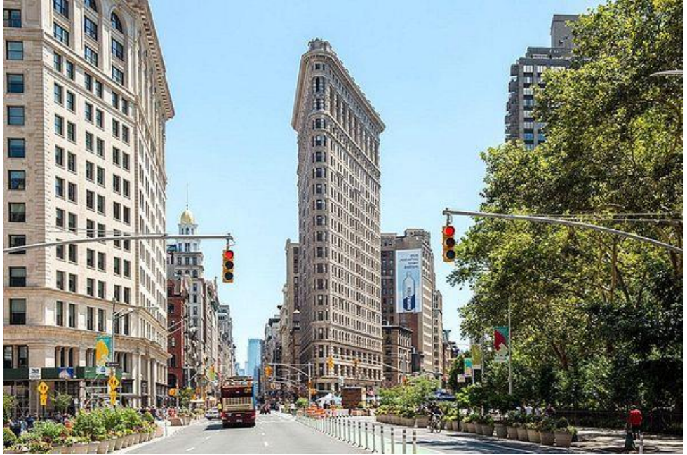
The Flatiron Building

ship!” But now the Flatiron Building, with its unusual shape, is one of the favorite sights in the city.