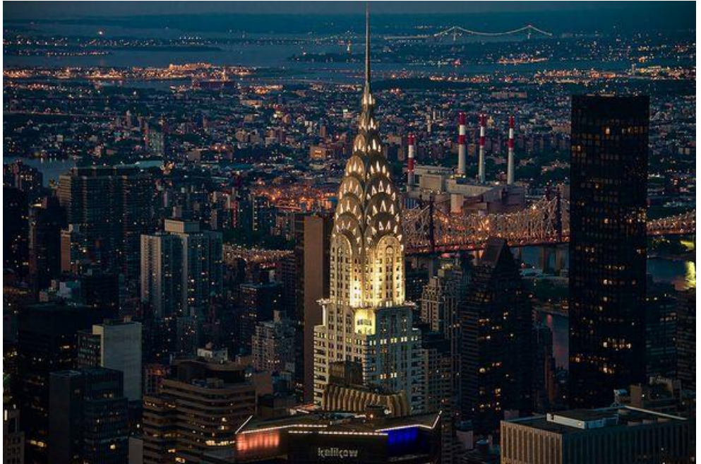
The Chrysler Building

More books on http://adapted-english-books.site